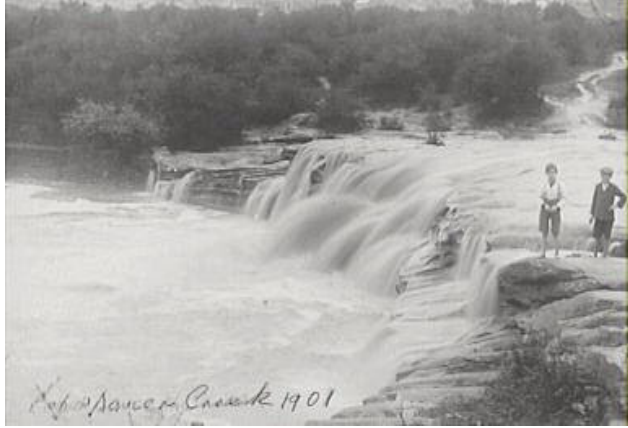
Cup and Saucer Creek, 1901 Photo: Courtesy of Canterbury Council Local History Library. No. 020034.

The photos below show how it has changed over time.